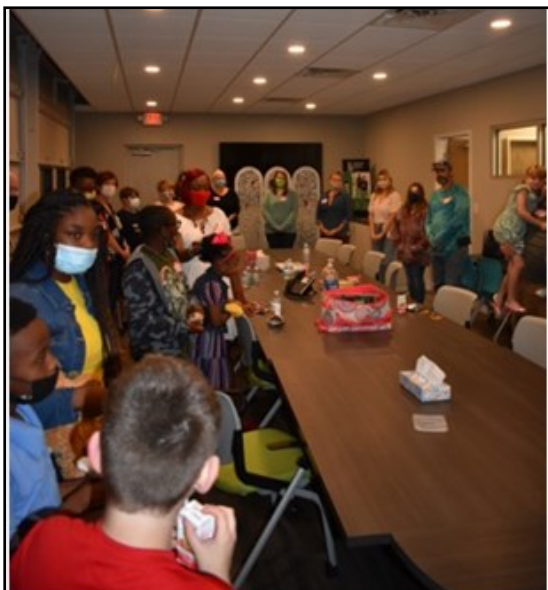
Group night closing circle - all age groups come back together for closing announcements and hand squeeze around the room