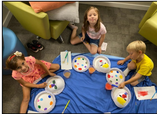
Lower Elementary age group works on the nights activity: Masked Emotions